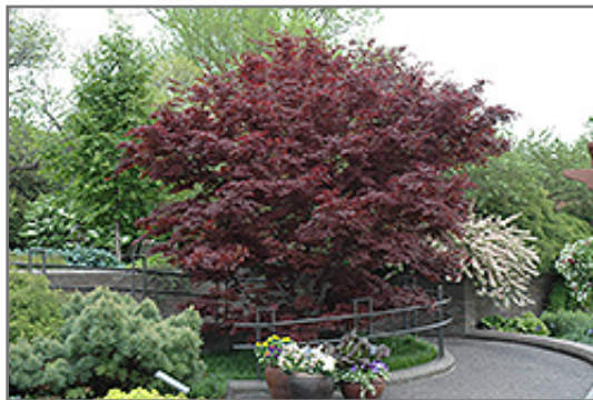
Bloodgood Japanese Maple

Bloodgood Japanese Maple is recommended for the following landscape applications;