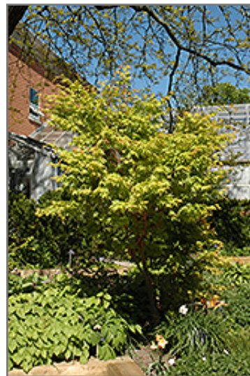
Coral Bark Japanese Maple