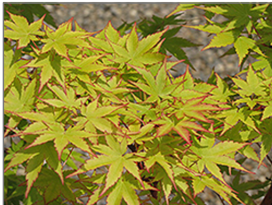
Coral Bark Japanese Maple foliage

This is a relatively low maintenance tree, and should only be pruned in summer after the leaves have fully developed, as it may 'bleed' sap if pruned in late winter or early spring. It has no significant negative characteristics.