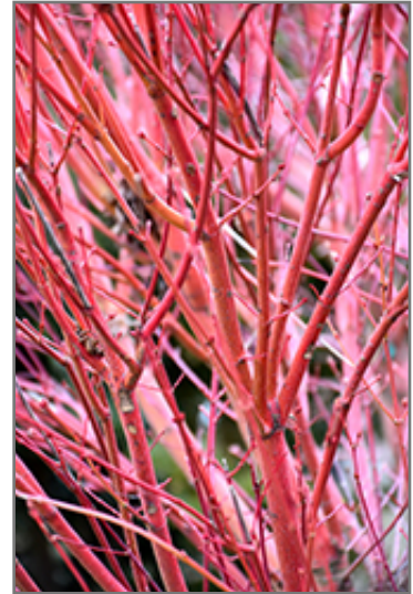
Coral Bark Japanese Maple stems

This tree does best in full sun to partial shade. You may want to keep it away from hot, dry locations that receive direct afternoon sun or which get reflected sunlight, such as against the south side of a white wall. It prefers to grow in average to moist conditions, and shouldn't be allowed to dry out. It is not particular as to soil pH, but grows best in rich soils. It is somewhat tolerant of urban pollution, and will benefit from being planted in a relatively sheltered location. Consider applying a thick mulch around the root zone in winter to protect it in exposed locations or colder microclimates. This is a selected variety of a species not originally from North America.