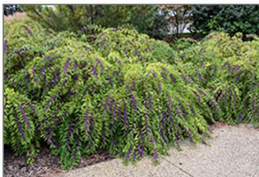
Issai Beautyberry fruit