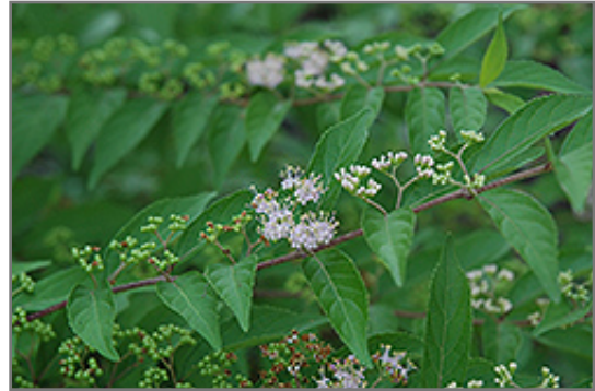
Issai Beautyberry flowers

Issai Beautyberry will grow to be about 4 feet tall at maturity, with a spread of 5 feet. It tends to fill out right to the ground and therefore doesn't necessarily require facer plants in front. It grows at a fast rate, and under ideal conditions can be expected to live for approximately 20 years.