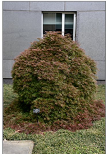
Orangeola Cutleaf Japanese Maple