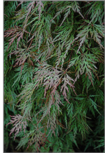
Orangeola Cutleaf Japanese Maple foliage

This is a relatively low maintenance tree, and should only be pruned in summer after the leaves have fully developed, as it may 'bleed' sap if pruned in late winter or early spring. It has no significant negative characteristics.