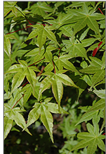
Shindeshojo Japanese Maple foliage

Shindeshojo Japanese Maple is recommended for the following landscape applications;