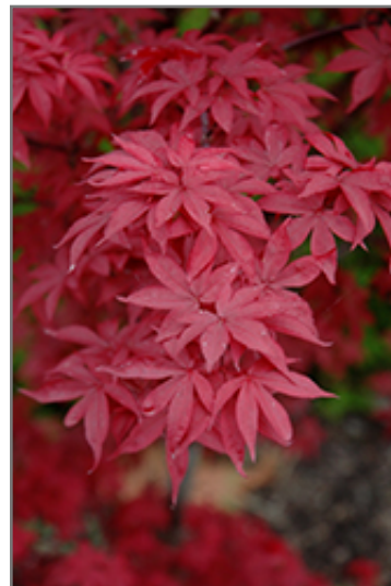
Twombly's Red Sentinel Japanese Maple foliage

Twombly's Red Sentinel Japanese Maple is recommended for the following landscape applications;