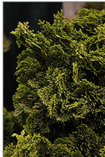
Dwarf Hinoki Falsecypress foliage