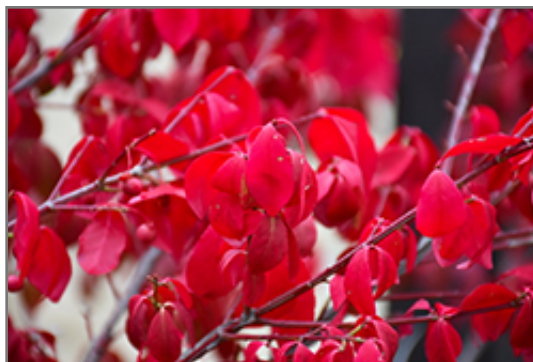
Rudy Haag Burning Bush in fall