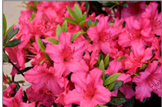
Girard's Rose Azalea flowers