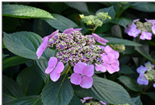
Blue Wave Hydrangea flowers