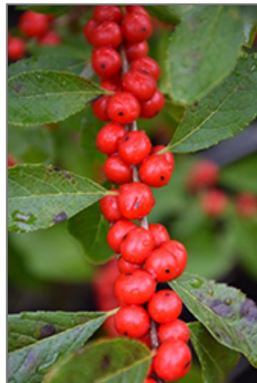
Red Sprite Winterberry fruit