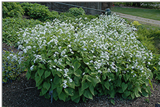
Perennial Money Plant in bloom