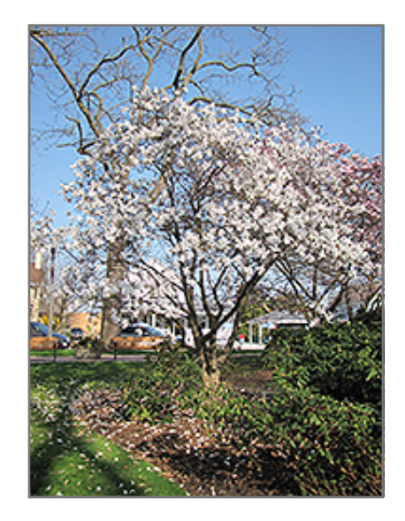
Waterlily Magnolia in bloom