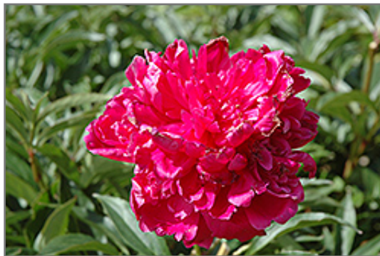
Laura Dexheimer Peony flowers